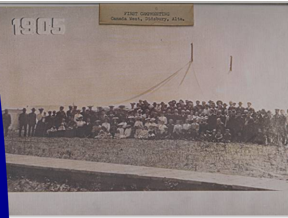
First Camp Meeting Canada West, Didsbury, AB

would attend. How excited the young people were when they saw a huge tent slowly billowing outwards as men tugged at the ropes and pushed on the poles to get it upright! The youngsters had never been in a “tent church” before. Small family tents dotted the grounds on all sides—reminiscent of the 12 tribes of Israel encamped around God’s tabernacle in the wilderness.