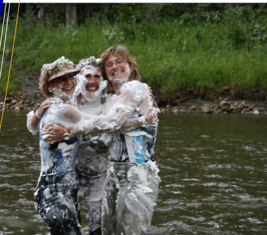
River's Edge Camp and Conference Centre

But one couldn't have a camp without cabins. So the Board challenged the 30 churches supporting River's Edge to build one each. Many of them took up the challenge, came to the camp, built and paid for its cabin at $2,100 each - leaving 16 cabins nestled among the trees. Washrooms, staff housing, plus 27 RV sites among the aspens have also been provided since it became the district camp. At its dedication on