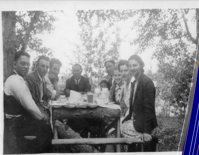
Elkton Valley Camp

Almost all camp meetings of the Missionary Church had moved from place to place before a permanent site was chosen. Didsbury Camp was a notable exception. Not long after the settlers arrived in the west, they began planning for a camp program. The first step was the acquisition in 1905 of five acres of land right in the centre of Didsbury. Next was a tent large enough to hold services for the throngs who