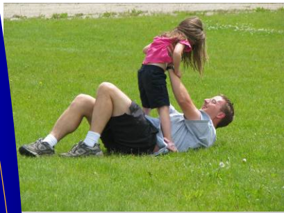
River's Edge Camp and Conference Centre