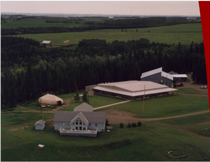
River's Edge Camp and Conference Centre

July 1, 1999, 770 people attended the ceremony. Torrents of rain fell on the event, but spirits were good and most stayed for the celebration feast. "It's a miracle!" they all agreed.