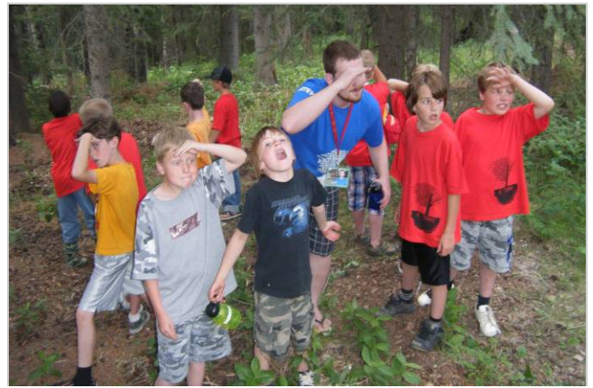
River's Edge Camp and Conference Centre

But God had been doing a work that in many ways was not as anyone imagined. His timing and His plans were unfolding but in a way that would require even greater faith and a willingness to consider significant changes and new directions for the camp to effectively minister to the next generation of campers, staff and guests. It was as if God was looking to establish a new future, a new camp that would be built on the legacy of its predecessors but a camp with its own identity, distinctives, and direction. For that to happen, like a grain of wheat that is planted into the ground and must first die to bring forth a bountiful harvest, so the new camp would need to have a death to it's old self and then arise to have an even more bountiful harvest than could have ever been envisioned.