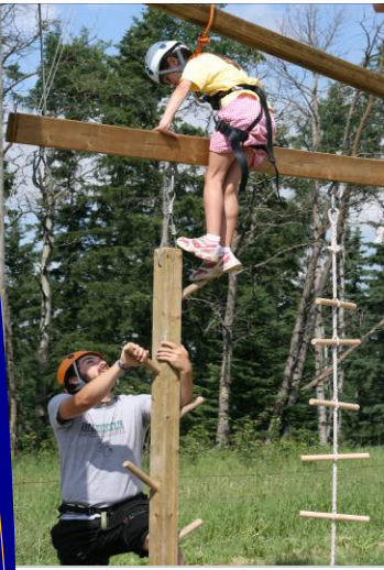
River's Edge Camp and Conference Centre