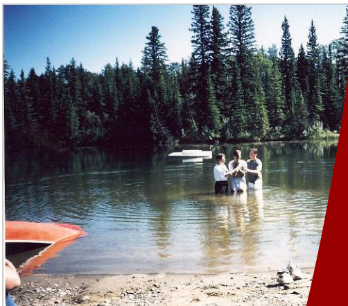
James River Bible Camp

What more could one want? Nevertheless, seven years after the union of the Missionary and Evangelical Churches in 1993, the Camp Board felt it best to sell both James River and Elkton Valley ground in order to join their programs and operate one large camp adequate enough to accommodate hundreds. A miracle would be needed to bring this about.