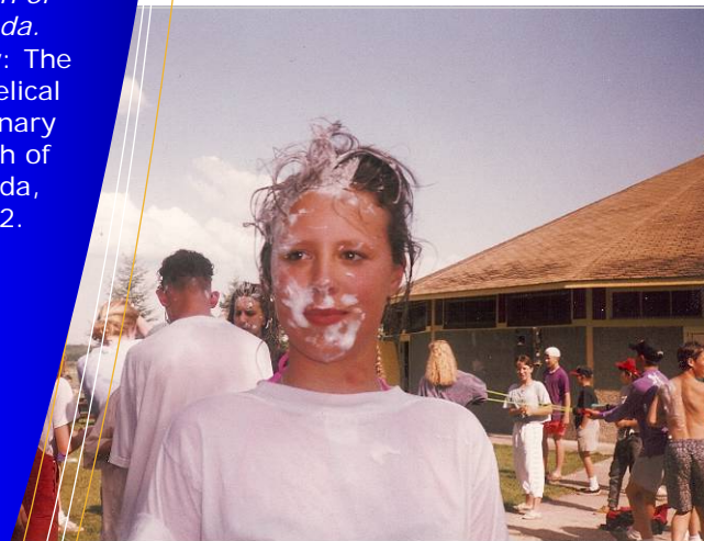
James River Bible Camp

Every day there were special services for children and young people, but in the evening all were expected to be under the big canvas to hear the evangelist preach. Church members recognized the value of this ministry; though it was a busy time of year, farmers took time off to bring their teenagers and children to camp. It was here that many were converted. Christian work in later years reaped the benefit of these changed lives both at home and abroad.