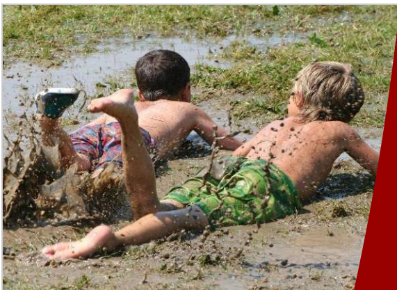
River's Edge Camp and Conference Centre

decibel music ascends to the heights of heaven. Horseback riding, wall climbing, high ropes, paintball, and other sports are very popular. The other activities throughout the summer and on weekends throughout the school year offer happy times and opportunities for