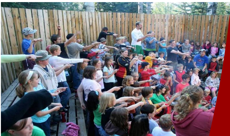
River's Edge Camp and Conference Centre

The camp continues to grow and plan its future! It will be a wonderful process seeing how God will raise up the resources, staffing and ministry partners to help ensure that River's Edge Camp and Conference Centre continues to be a place for Christ-centred life change in a natural setting for a supernatural experience.